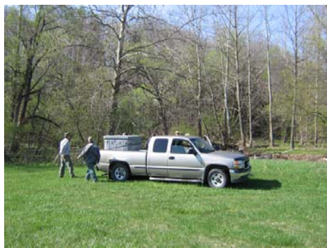
Arriving at the release site: Dingman Creek on the Circle R Ranch.