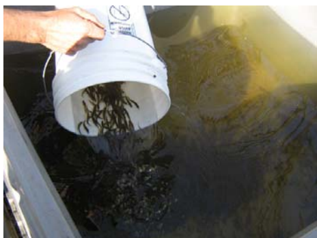
Into the transfer tank they go for the big trip!